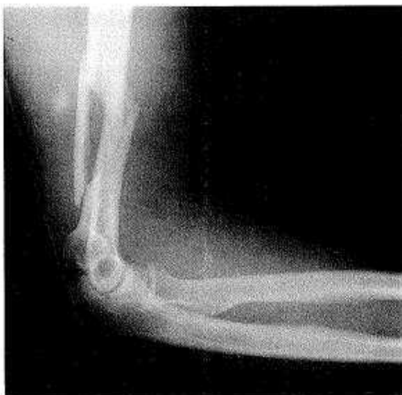
Figure 1. Radiograph of the distal right humerus and elbow. There is a spiral fracture of the distal humerus with a large butterfly fragment.

tion splint. Subsequently, she was placed in a humeral fracture brace. She healed uneventfully (Figure 2).