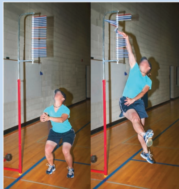
Figure 4. Sargent/vertical jump test to evaluate strength.

The sargent jump test is a reliable test for the estimation of explosive power of the lower limb. 1,24