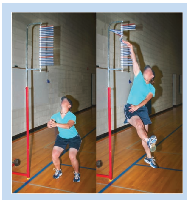
Figure 4. Sargent/vertical jump test to evaluate strength.

The sargent jump test is a reliable test for the estimation of explosive power of the lower limb.<sup>1,24</sup>