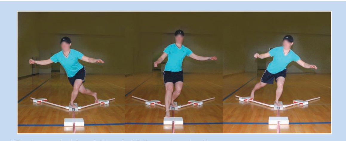
Figure 2. The star excursion balance test to evaluate balance and proprioception.