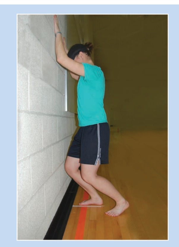
Figure 1. The dorsiflexion lunge test to evaluate range of motion.

73%.<sup>28,29</sup> Recurrence most strongly correlates with premature return to sport and a prior ankle injury.<sup>23</sup>